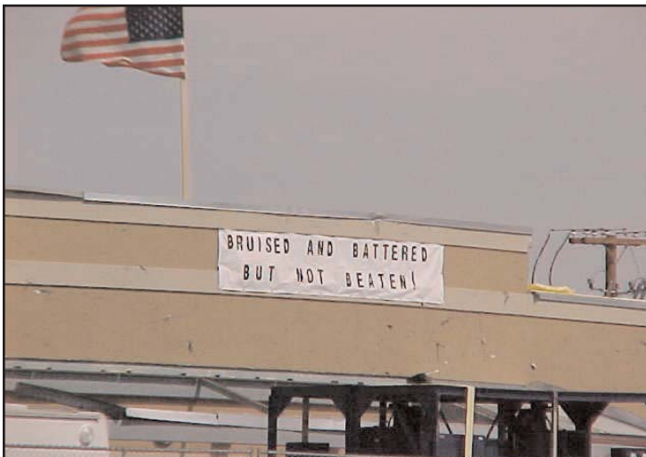
After a tornado on February 5, 13" of snow on March 6 and a flood on March 18, this sign in Mountain View could easily be the motto for most of Arkansas. Ten tornadoes on April 3 and flooding on the 4th created more needs in new locations.