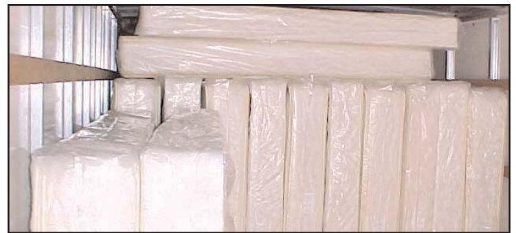
Mattresses were delivered to families who lost their bedding in Atkins and Gassville as part of Presbyterian Disaster Assistance, funded in part by gifts to One Great Hour of Sharing.

Stories from churches aiding their affected neighbors: