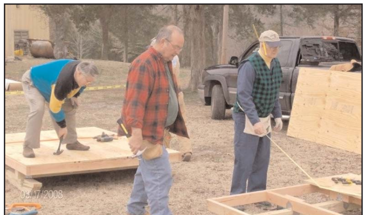
Workers like these from PC(USA) congregations are still needed at Cotter to construct storage sheds to shelter valuable belongings while the owners' homes are being repaired.