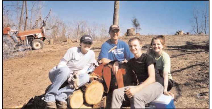
Part of the nine-member work crew from First, Jacksonville, take a break at Atkins on a March 1st workday.